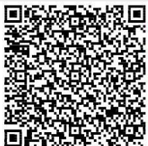
Data Erasure Supervisor

Model ST1000DM003-1ER162 SN W4Y1V7T6 Capacity 1.0 TB Health 100 % Status SUCCESSFUL Method NIST800-88PURGE Bootable NO Time 2020-04-24 10-08-18